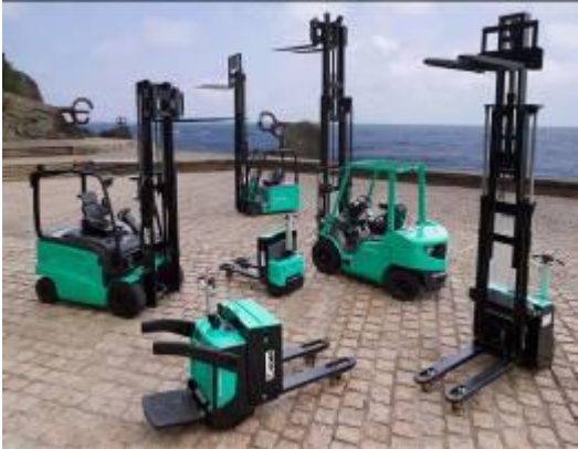
Figure 3: ULMA Carretillas: range of products

is the needs of controlling and improving battery life, because 90 % of equipments have batteries.