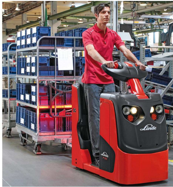
Tractor compact drag Linde P20 and Linde W04 platform is ideal for the production "lean". Other fields of application are the airports, hospitals and markets, for example.

The electric tow tractors have gained ground in the last 10 years. During this period, the market has recorded an average annual growth of 7% approximately. At the same time, have emerged, new fields of application. The new tractor takes into account these changes and has been designed as a specific solution to carry loads of up to two tons. This means that it can be used as a towed vehicle to transport up to five small containers of cargo (KLT). These towed vehicles are used in the automotive industry and in many other production environments. Optionally, the tractor is also available with platform with a capacity of 400 kg, with the name Linde W04.